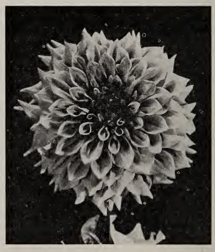
Wenoka (F. D.) 1935

The World (F. D.)— The color of this variety is a deep rosy magenta overlaid garnet and with silver shadings on the edges of the petals. The stems are perfect. Foliage heavy and resistant to insects. A splendid thrifty grower and much admired the past season. Another one of our best Dahlias. ROOTS, 50c